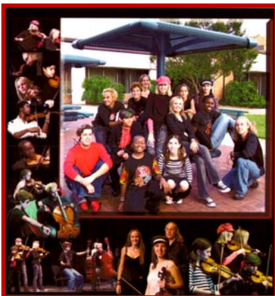
High Velocity Strings