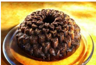
CHOCOLATE GRAND MARNIER® CAKE