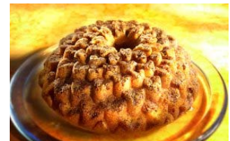
GRAND MARNIER® CAKE