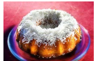
MALIBU® COCONUT RUM CAKE

Chocolate Grand Marnier® cake: Chocolate! Orange! What more can I say? Two flavors that were born to go together meet magnificently in this marvelous munchie! Enough reading already. Mangia! Made with Grand Marnier® Liqueur, fine chocolate and freshly-grated orange peel. Sprinkled with chopped walnuts & pecans.