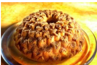
LEMON CHAMBORD® CAKE

Malibu® Coconut Rum cake: Flavor of de islands, mon! Malibu® Coconut Rum and shredded coconut take your tongue to a tropical beach with shady palms.